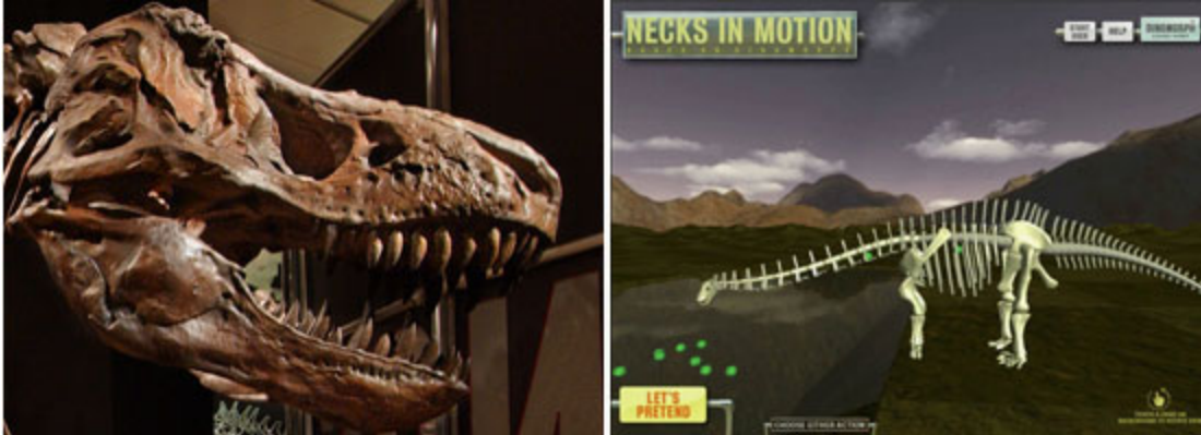
Come face to face with T. Rex or explore the biomechanics of dinosaurs

If you have such a project of your own in mind, please do not hesitate to contact us to discuss further.