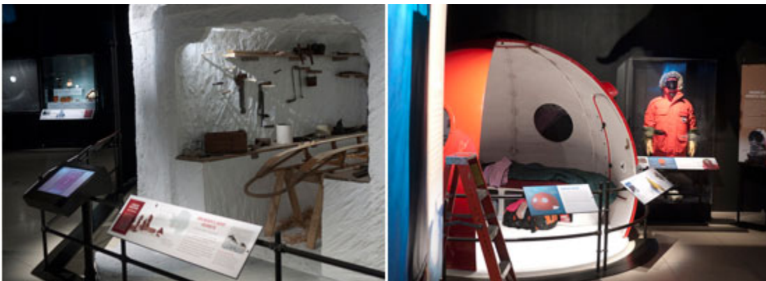
Life-sized diorama of Amundsen's winter camp and modern science at the Pole

The National Geographic Museum in Washington, D.C. is currently hosting Race to the End of the Earth , a thrilling tale of Scott and Amundsen's race to be the first explorer to reach the South Pole. The exhibition travels next to Italy, but there are two openings available in summer 2012 through early 2013 before it continues on the rest of its international tour!