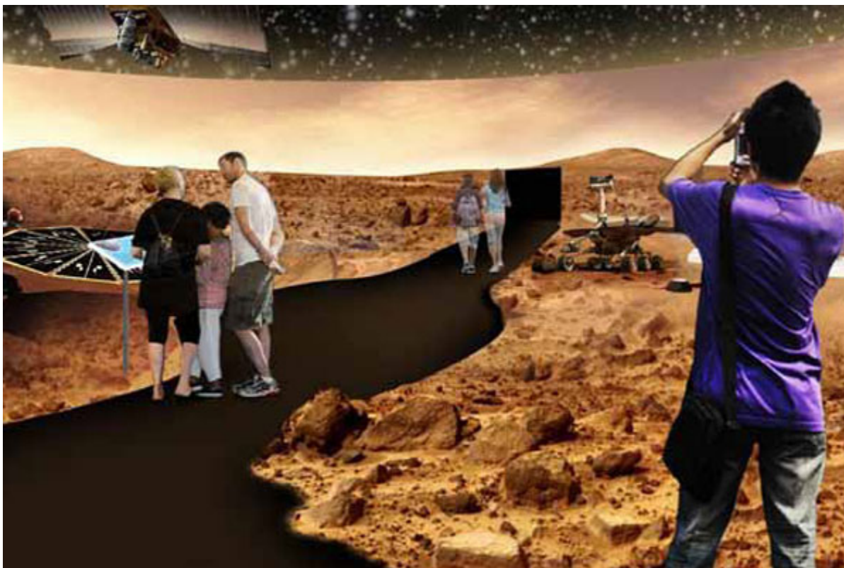
Walk on the surface of Mars in Beyond Earth

Beyond Earth: The Future of Space Exploration will open in New York on November 19, 2011-watch for more details. Afterwards, there is a unique opportunity for a North American venue to host the show in the fall of 2012 before it leaves the country for an international tour.