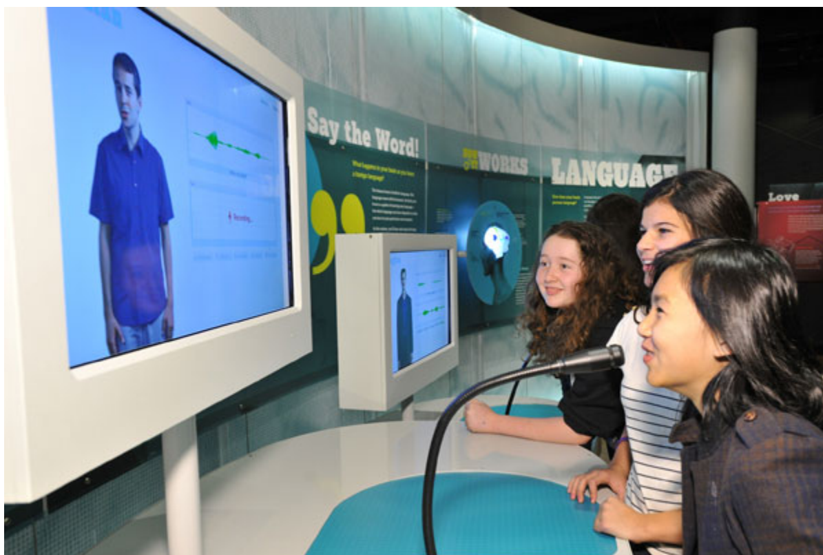
Test your language skills at one of the many interactives in Brain: The Inside Story

After a phenomenal opening at the American Museum of Natural History (averaging 1,460 visitors per day!), Brain: The Inside Story will be closing in New York on August 14. But that's just the beginning—the show next heads to China to begin its international tour. Slots are booked through 2014 and later slots are filling up fast. Brain: The Inside Story fits galleries ranging from 6,500 sq ft and up.