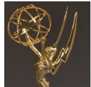
6 GOLDEN ACHIEVEMENT features gold awards for cultural achievement

Gold is organized by the American Museum of Natural History, New York ( www.amnh.org ), in cooperation with The Houston Museum of Natural Science. This exhibition is proudly supported by The Tiffany & Co. Foundation, with additional support from American Express® Gold Card.