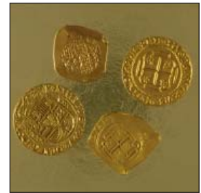
4 LOST AND FOUND showcases gold as treasure: coins, bars, and shipwreck contents