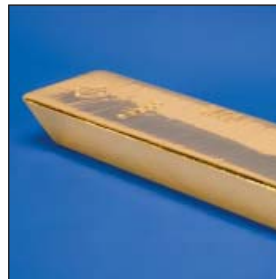
5 GOLD STANDARD displays gold currency throughout the ages