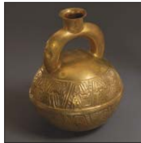
3 GOLDEN AGES features human-worked gold objects from all over the world