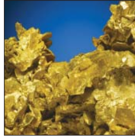
1 AURUM NATURAE showcases stunning natural gold specimens and introduces the variety of forms gold can take